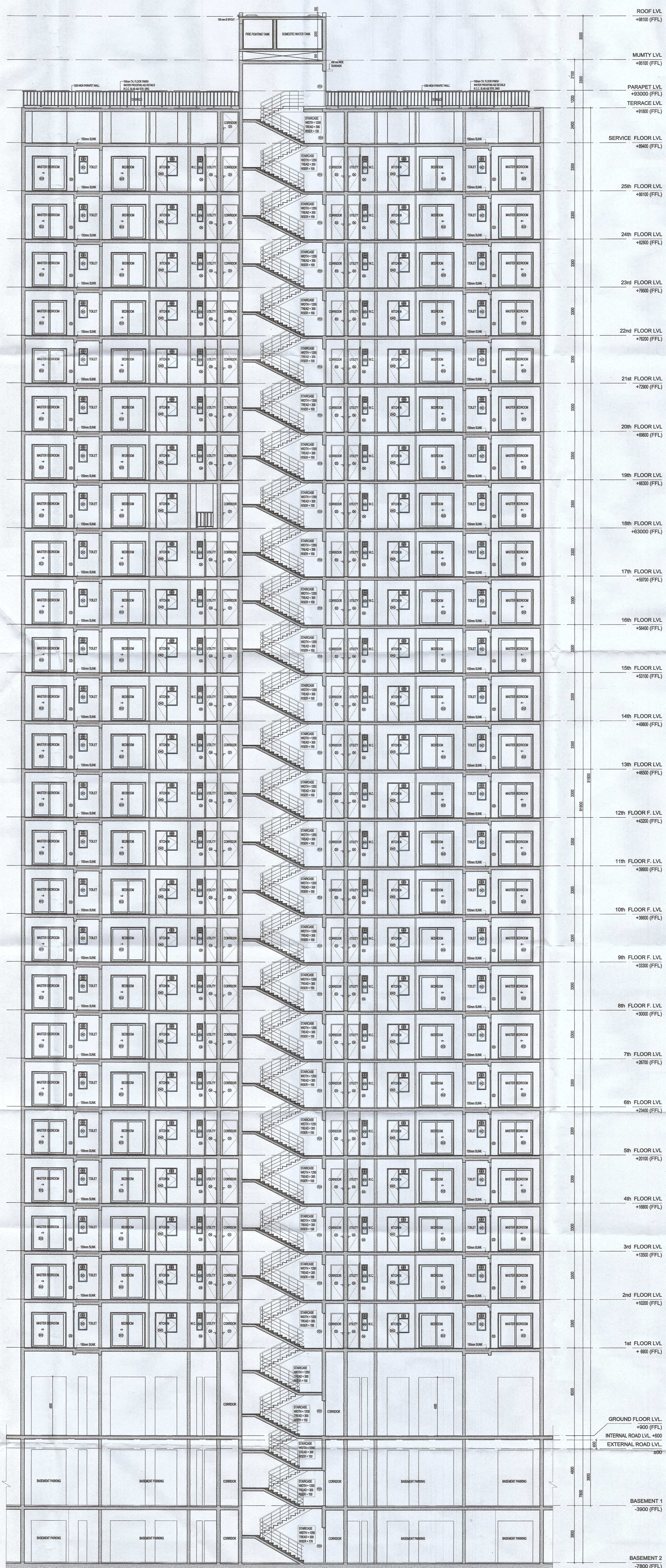
SECTION - BB'

This is a "PROVISIONAL BUILDING PLAN" approved only for the purpose of inviting objections from the general public.