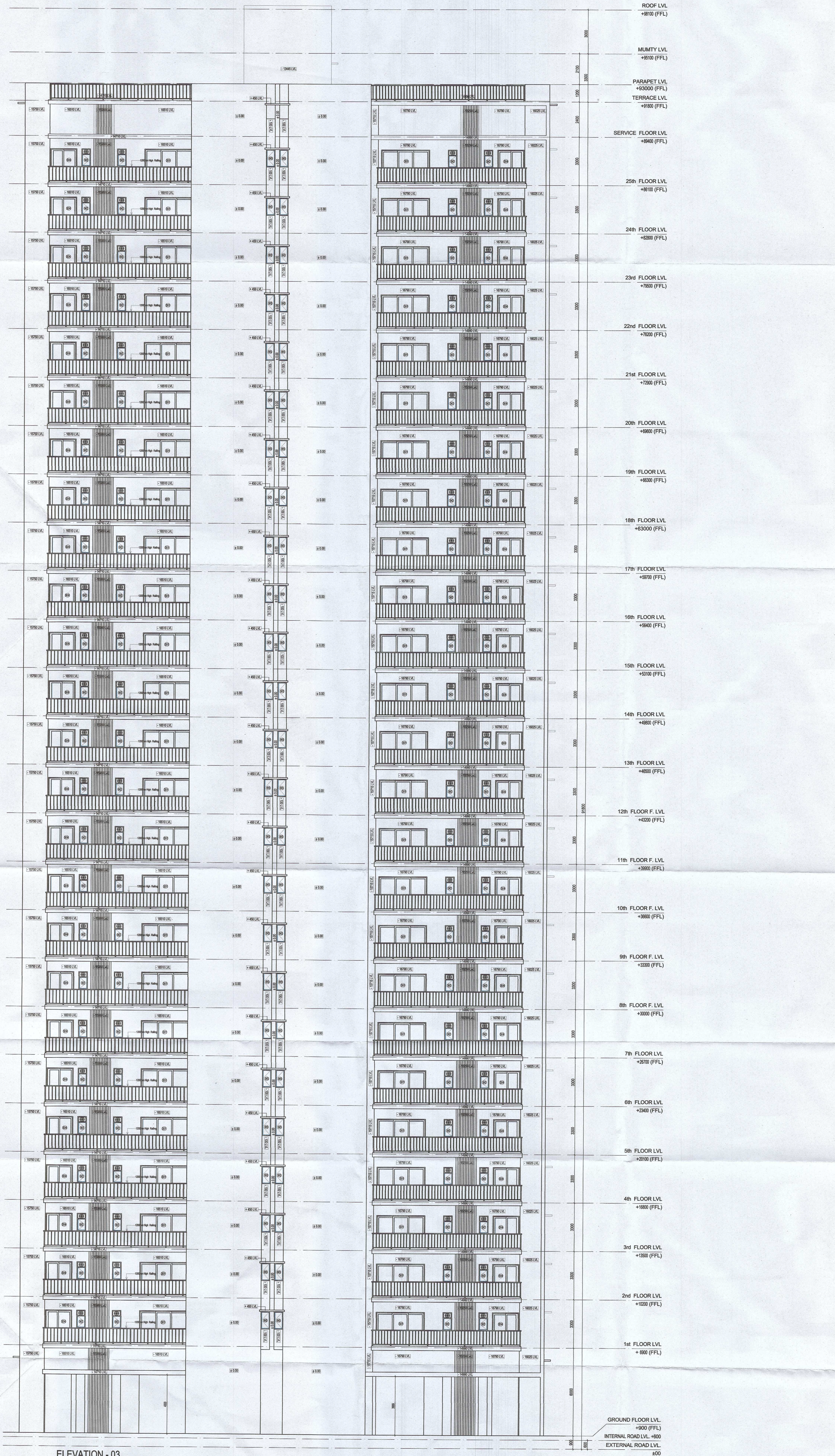
ELEVATION - 03